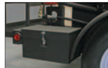
Optional Side Saddle Tool Box