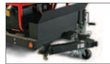
Optional Rock Guard (shown with hinged trailer tongue)