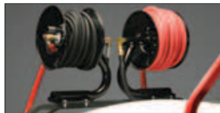
Optional Hose Reel and Mounting Kit